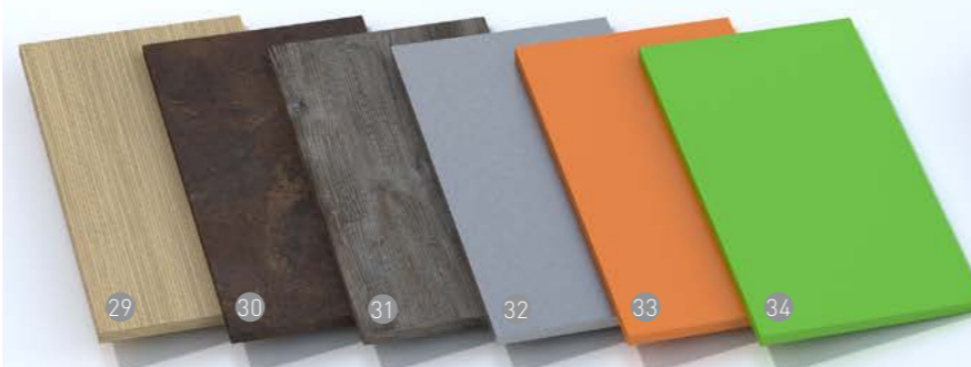
29. Pinstripe Oak 30. Rust 31. Weathered Pine