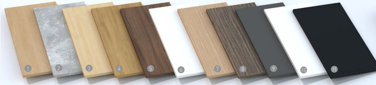
1. Beech 2. Concrete 3. Maple