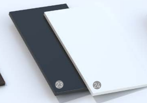
23. Gloss Black 24. Gloss White