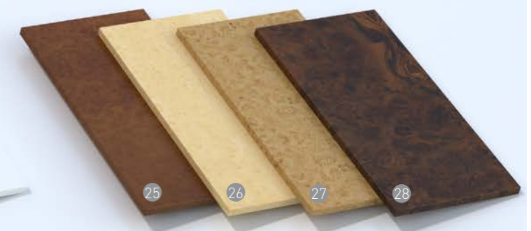
25. Burr Madrona 26. Birds-Eye Maple