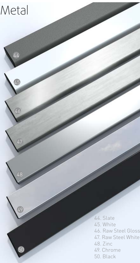
44. Slate 45. White 46. Raw Steel Gloss 47. Raw Steel White 48. Zinc 49. Chrome 50. Black