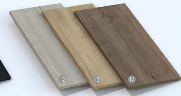
12. White Halifax Oak 13. Natural Halifax Oak 14. Tabacco Halifax Oak