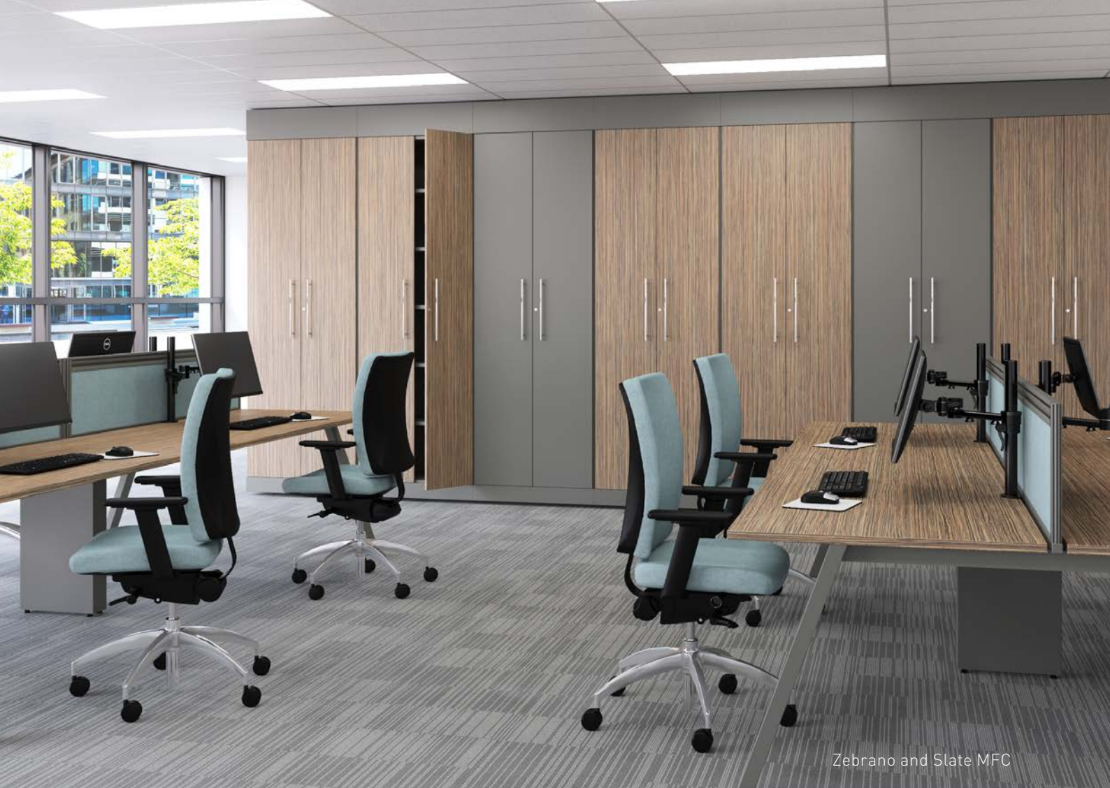
Zebrano and Slate MFC